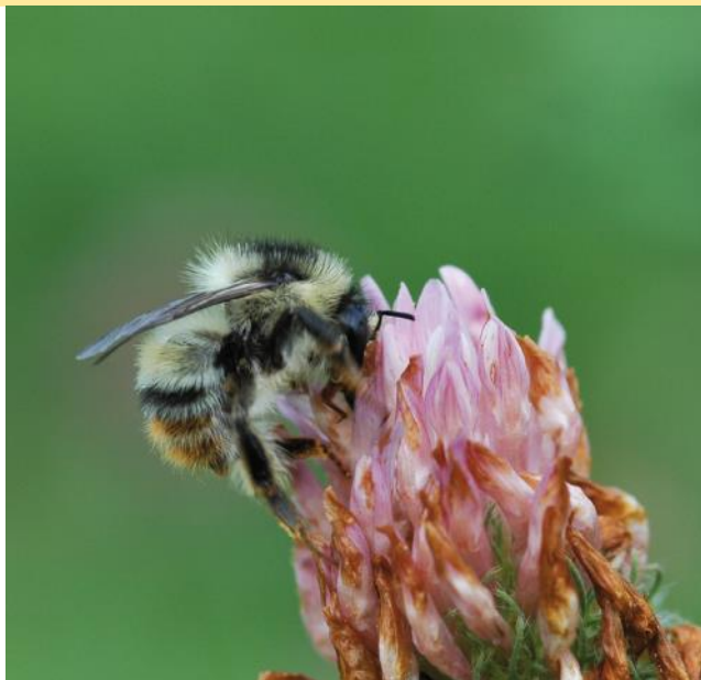
Left: Shrill carder bee ( Bombus sylvarum )