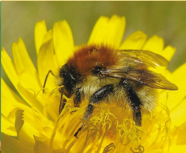
Right: Brown-banded carder bee ( Bombus humilis )

The Shrill carder bee has a single black band on its thorax, and two dark bands across its body with a pale orange tail. The Brown-banded carder bee is a tawny coloured bee with a brown band on the top of the body. Both of these bumblebee species were once widespread in the early part of the 20th century, they rapidly declined in the 1960s and due to the extent of their declines they are both Species of Principal Importance.