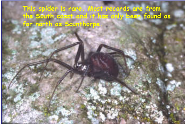
This spider is rare. Most records are from the South coast and it has only been found as far north as Scunthorpe.

Please note down the total number of each type of spider you saw over the weekend