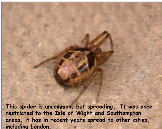
This spider is uncommon, but spreading. It was once restricted to the Isle of Wight and Southampton areas, it has in recent years spread to other cities, including London.

This is a large black and shiny spider that looks like a black widow (but without the red colour). The spider is usually black or occasionally has a pattern of white spots along the top of the abdomen. The spider's body (not including the legs) can reach the size of a one pence coin.