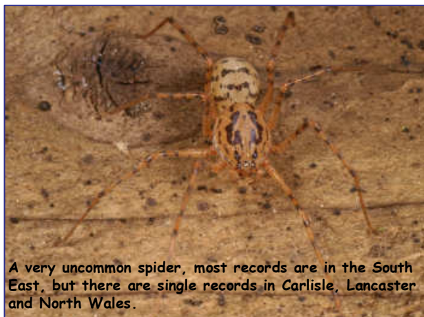
A very uncommon spider, most records are in the South East, but there are single records in Carlisle, Lancaster and North Wales.

This is the only spider in the UK known to cause any harm to humans. A bad reaction resulting from a bite will include localised swelling and nausea