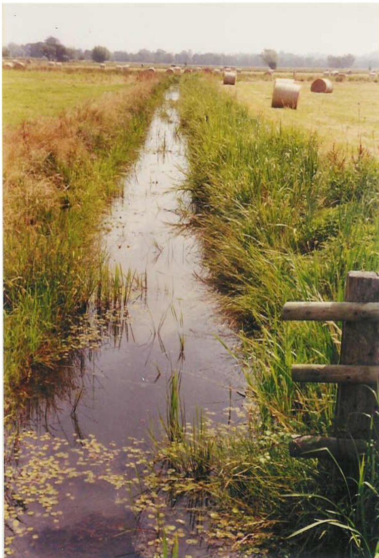
Arable ditch