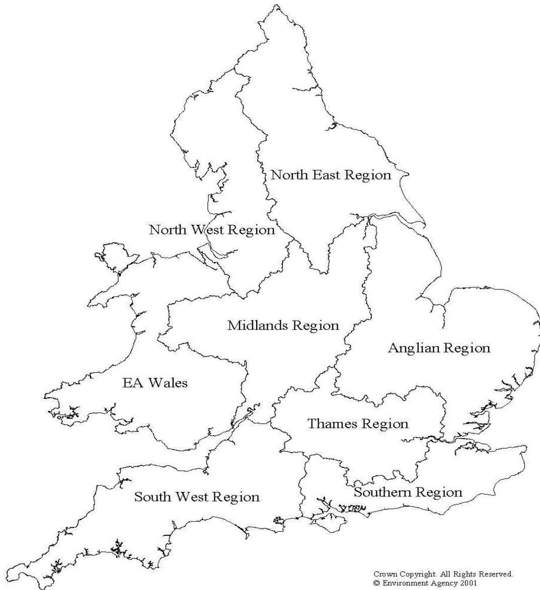
Figure 1 Map of Environment Agency regions