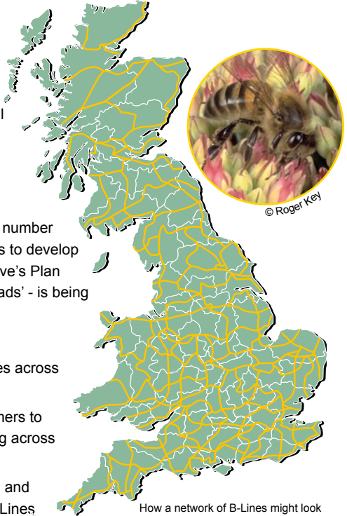
How a network of B-Lines might look